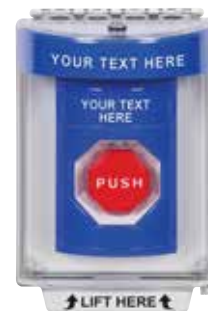
Universal Stopper® (Covers 3, 4, 7, 8)

No labeling can be placed on the Stopper Station shield.