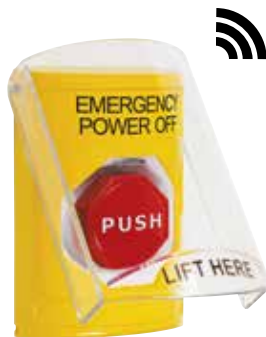
Stopper® Station Shield (Cover 2, A)

Covers to protect your STI Stopper Station from damage or weather and to help stop malicious or accidental activation.